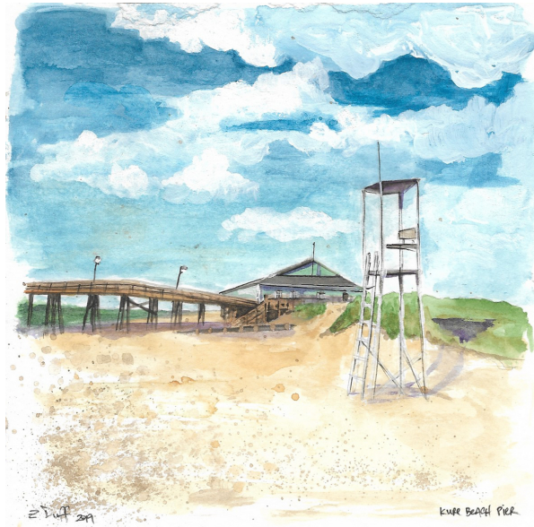
"Lifeguard Tower" -Zak Duff

version or drop by the Leland Cultural Arts Center to grab your hard copy today.