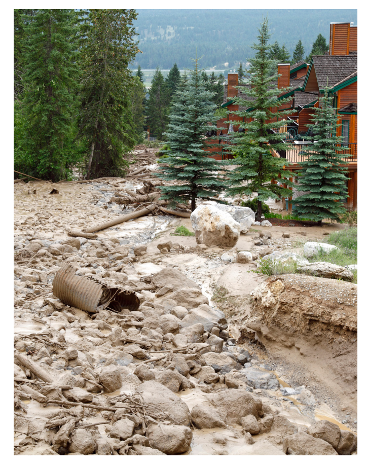
Mud slide with rock, boulders, and debris

The Minnesota Department of Natural Resources lists stabilizing slopes using native vegetation and drainage improvements as one way to mitigate landslide hazards.