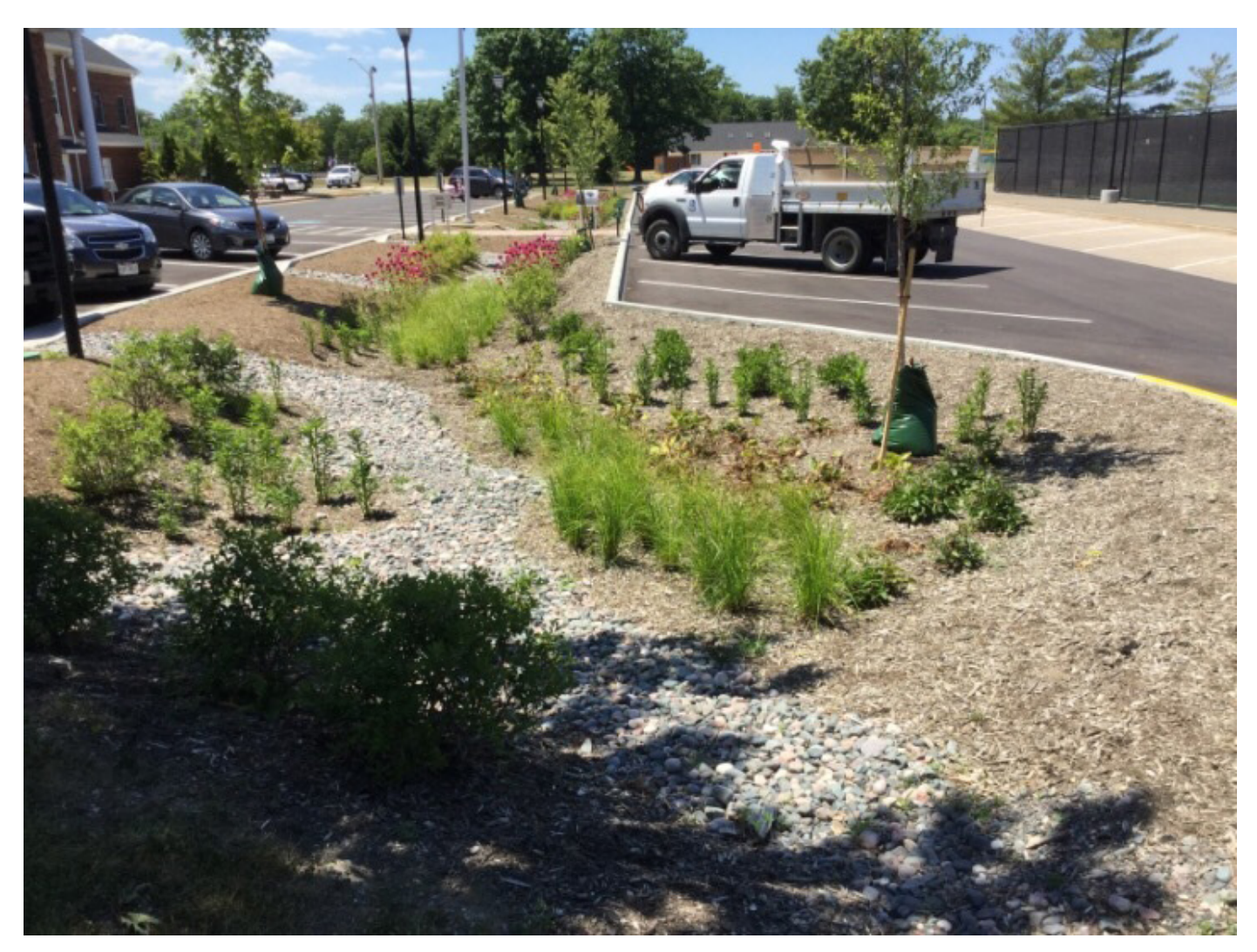
Rain Garden — City Hall in Bay Village, OH

The illustrations on the following pages are examples of nature-based solutions and do not cover all options.