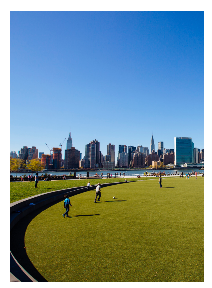
Hunter's Point South Park, a part of Gantry Plaza State Park, NY