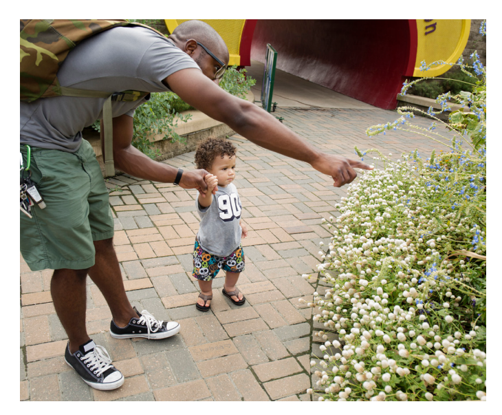
Father and toddler examining plants in a park in Norfolk, VA

In Nashville, Tennessee, properties in a combined sewer overflow area may receive a discount on their sewer fees if nature-based solutions are incorporated. Similar incentives are part of stormwater utility programs in Philadelphia and Washington, DC. In Lancaster, Pennsylvania, stormwater credits available to all property owners can reduce fees by up to 50 percent a year. To qualify, owners must use nature-based solutions on the property.