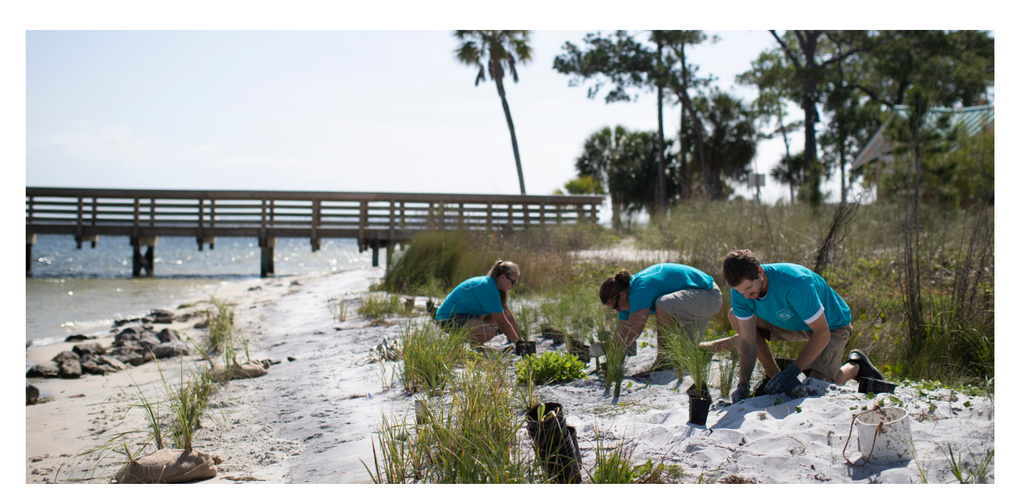
Volunteers planting sea grass on a beach in Florida.