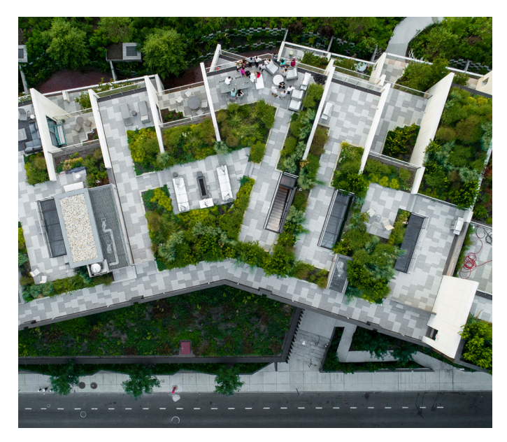
Modern rooftops, Brooklyn Heights, New York City

Environmental Impact Bonds have already been issued in several cities, including Washington, DC and Atlanta, Georgia, where they are funding a range of nature-based solutions projects to reduce stormwater runoff and address critical flooding issues.