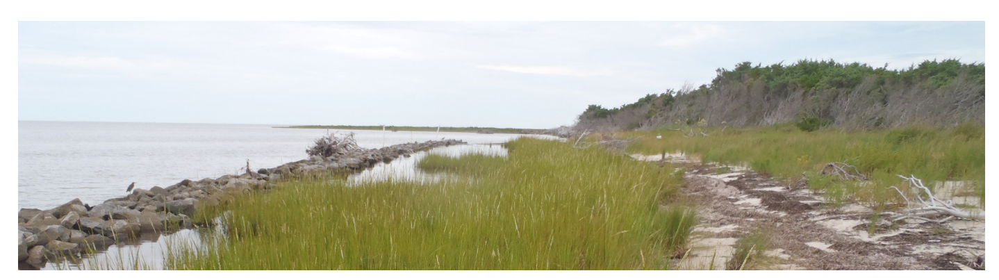
Hatteras, NC. The Durant's Point living shoreline project protects the shoreline from storm surge while providing habitat for many species. Since its construction, the project has weathered hurricanes, a summer of drought, and tropical storms.