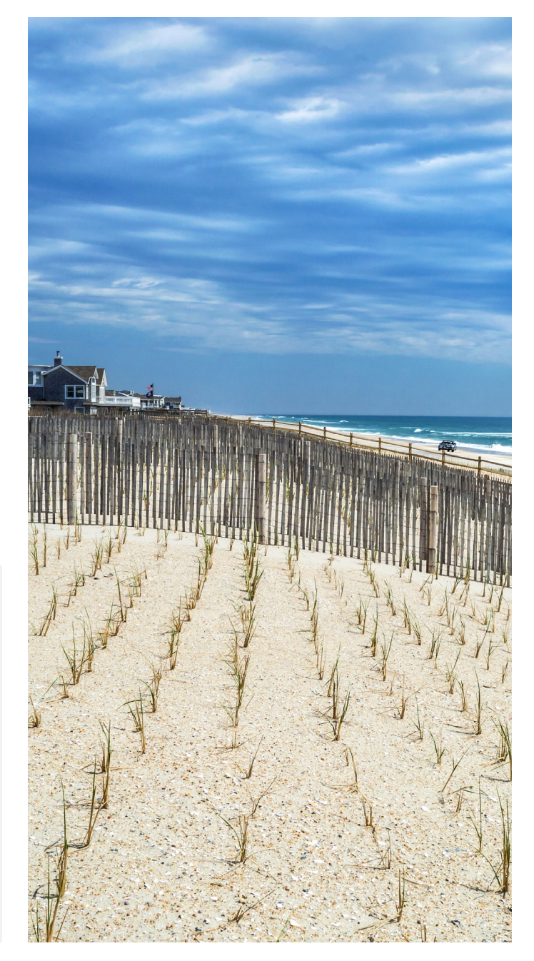
Managed dune on Long Beach Island, NJ. Dune restoration is an example of nature-based solutions that can be funded by many federal funding sources.

The Camden County Municipal Utility Authority was awarded a $5.4 million loan from the New Jersey Infrastructure Bank, the state's CWSRF, to fund a city-wide nature-based solutions project. The project has an estimated cost savings of $3.1 million over the 30-year loan. It involves building nature-based solutions throughout the City of Camden, including rain gardens and porous concrete sidewalks. The project also has a green jobs component. In the past 3 years, Camden trained about 240 youths in nature-based solutions maintenance.