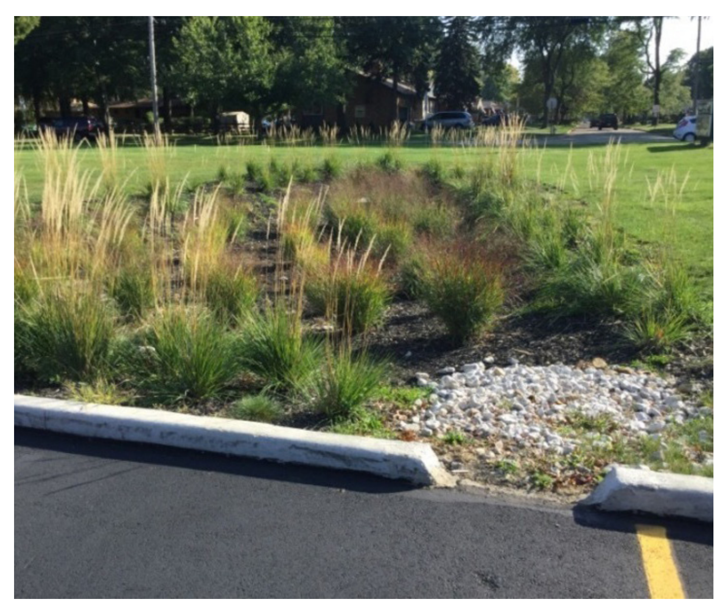
Rain Garden — Greenbriar Middle School in Parma, OH