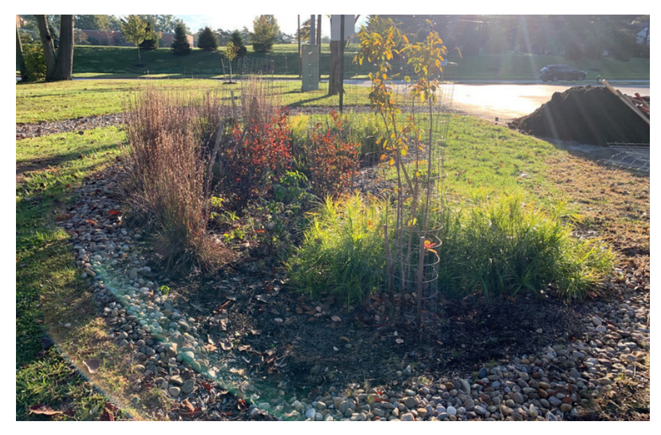
Rain garden in Euclid Creek Watershed, OH.

The City of Cuyahoga Falls, Ohio used Hazard Mitigation Grant Program funding to buy and remove four homes that had flooded repeatedly. The resulting open space was used to create <u>The Rain</u> <u>Garden Reserve</u>, a beautifully landscaped public space. The Reserve also serves as a stormwater retention area, reducing flood risk for neighboring homes.