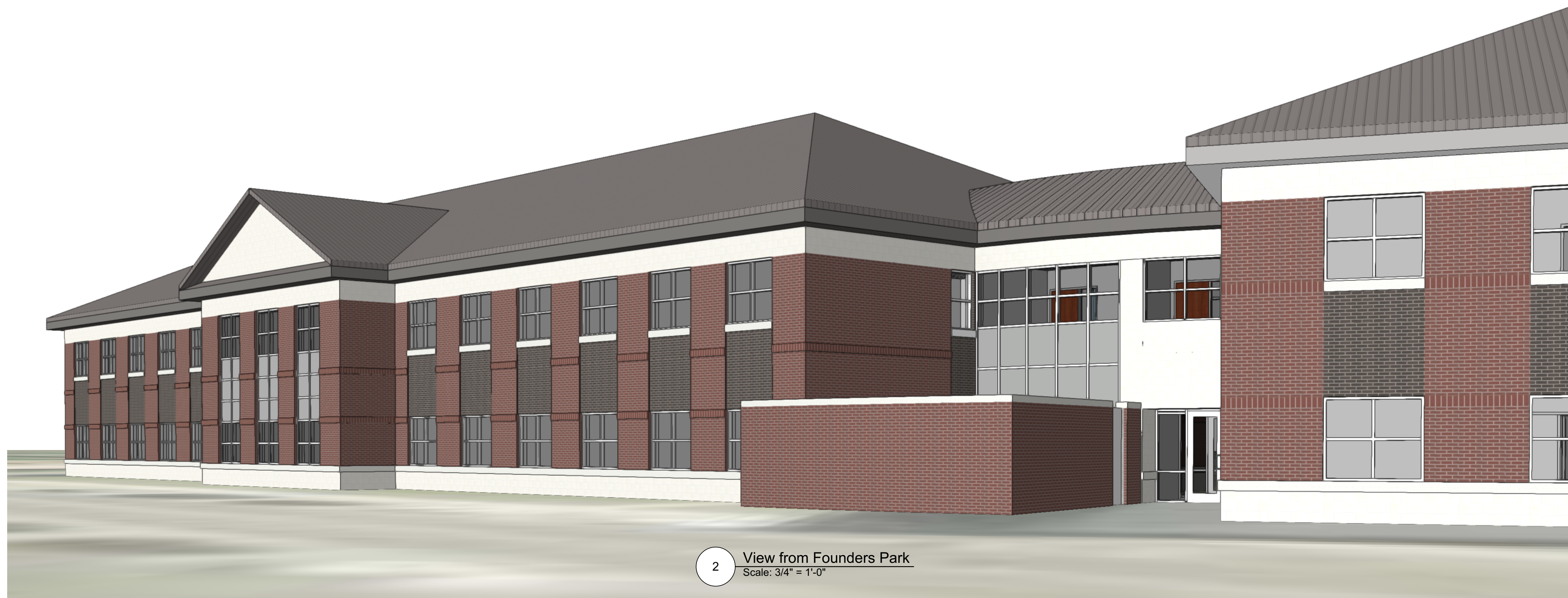
2 View from Founders Park Scale: 3/4" = 1'-0"