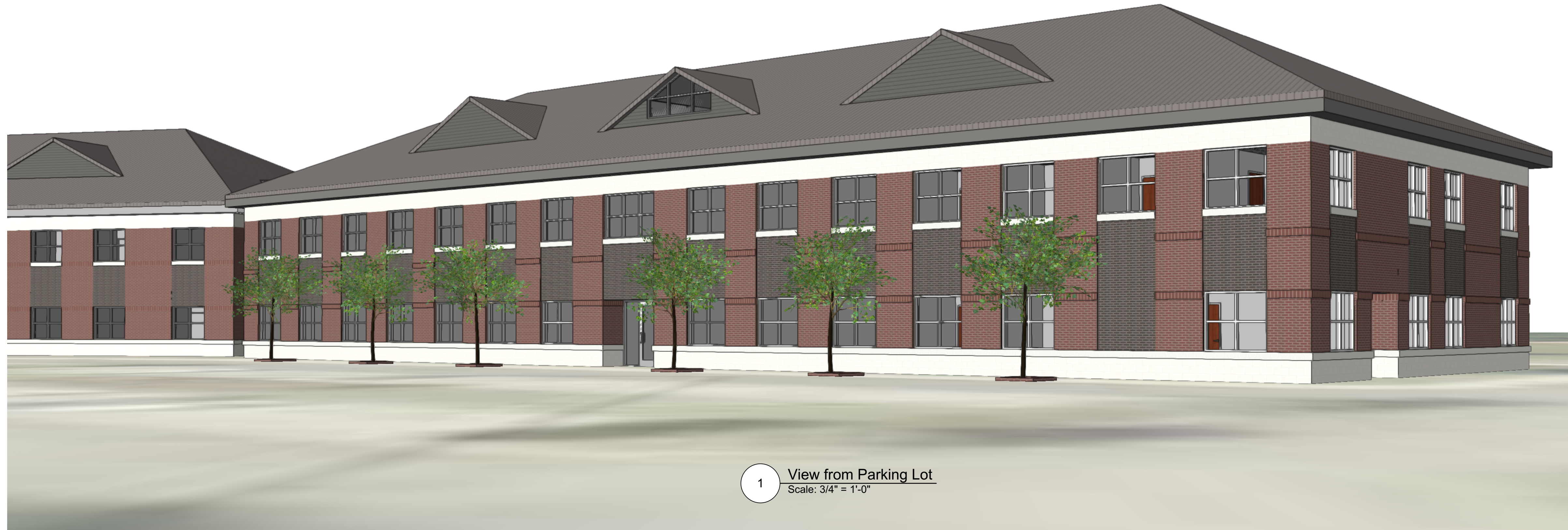
1 View from Parking Lot Scale: 3/4" = 1'-0"