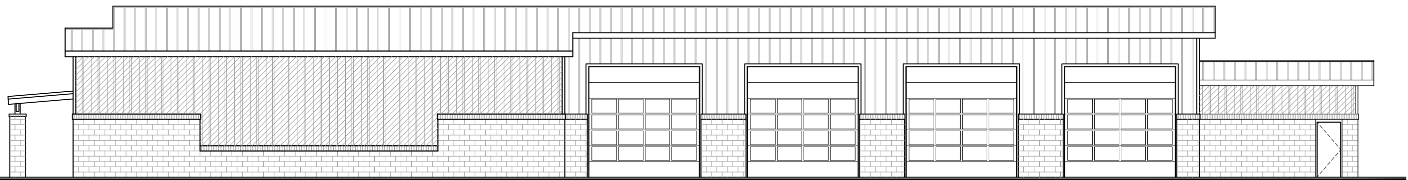
D EAST ELEVATION SCALE: N.T.S.