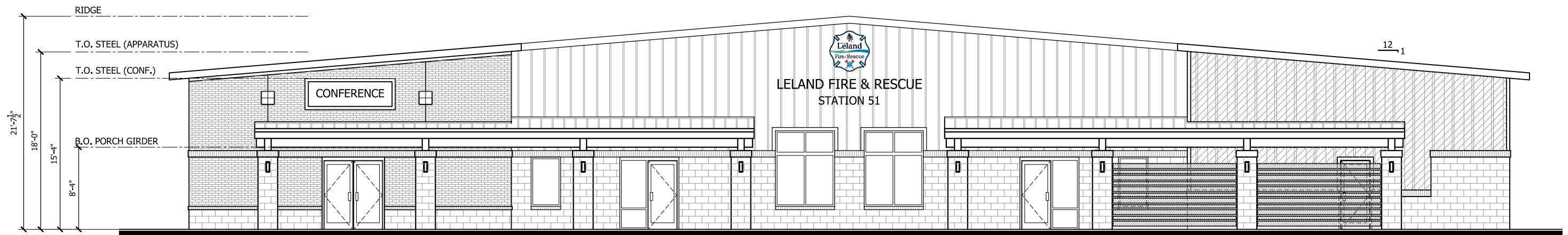
A SOUTH ELEVATION SCALE: N.T.S.