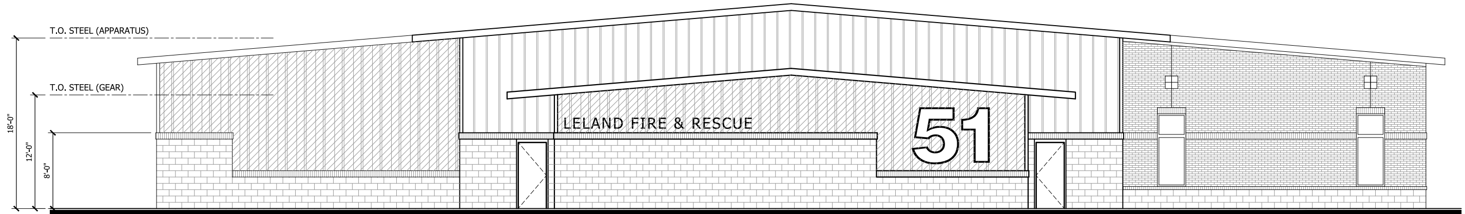
B NORTH ELEVATION SCALE: N.T.S.