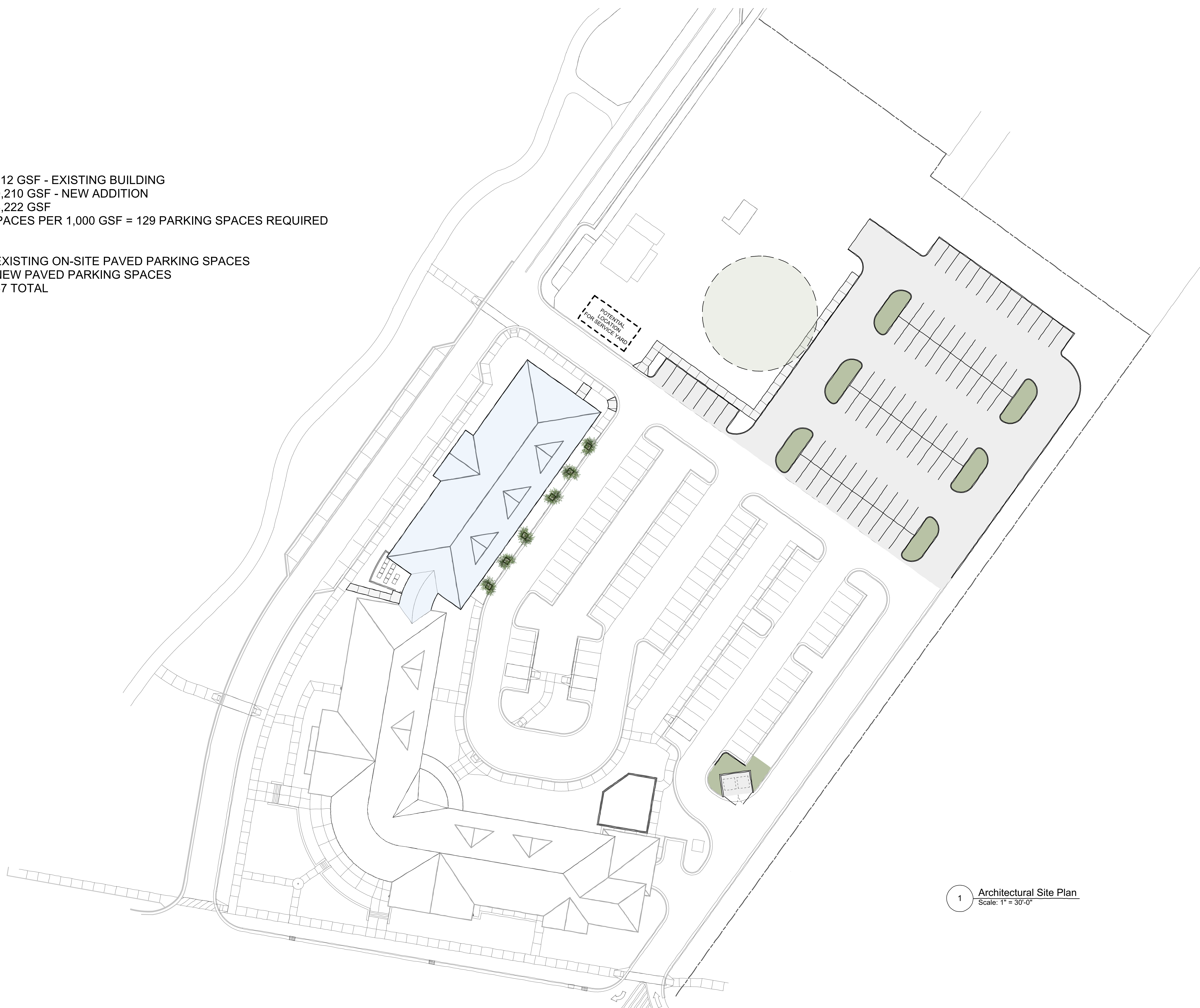
1 Architectural Site Plan Scale: 1" = 30'-0"

81 EXISTING ON-SITE PAVED PARKING SPACES 86 NEW PAVED PARKING SPACES = 167 TOTAL